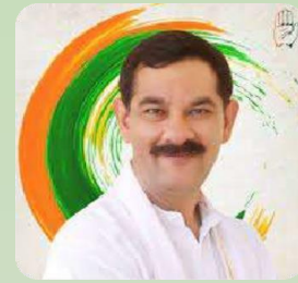
Hon'ble Shri Bhanwar Jitendra Singh General Secretary, AICC, India