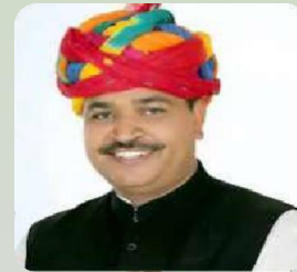
Hon'ble Shri Tikaram Juli Cabinet Minister- Social Justice & Empowerment, Rajasthan, India