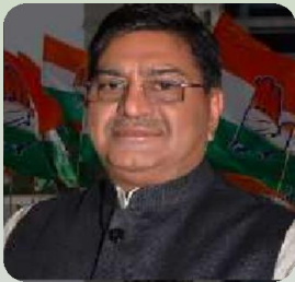
Hon'ble Shri Rajendra Singh Yadav Cabinet Minister- Higher Education, Home & Justice, Rajasthan, India