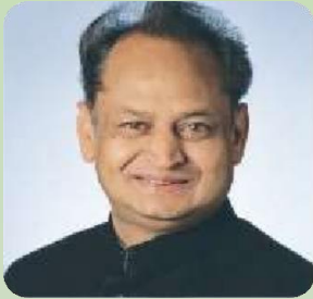
Hon'ble Shri Ashok Gehlot Chief Minister, Rajasthan, India