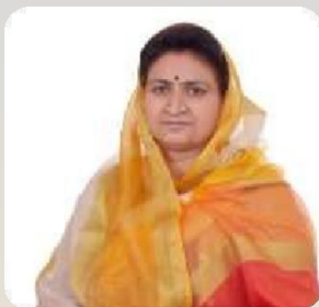
Hon'ble Shrimati Shakuntala Rawat Cabinet Minister- Industry, State Enterprises and Devasthan, Rajasthan, India